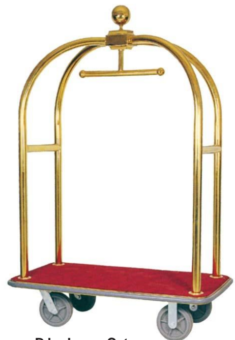
Deluxe Luggage Cart